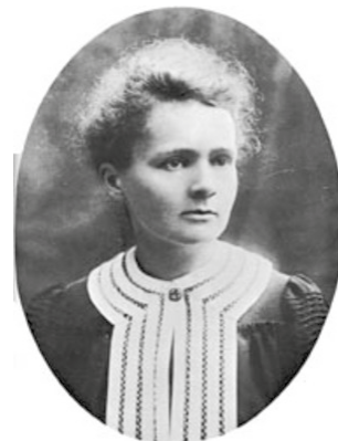
Marie Skłodowska-Curie, Nobel Prize winning Polish-French scientist renowned for her work on radioactivity

After all, science is essentially international, and it is only through lack of the historical sense that national qualities have been attributed to it.