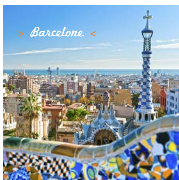
> Barcelone <

Our centre is among the best in France and is accredited by the French Ministry of Education .