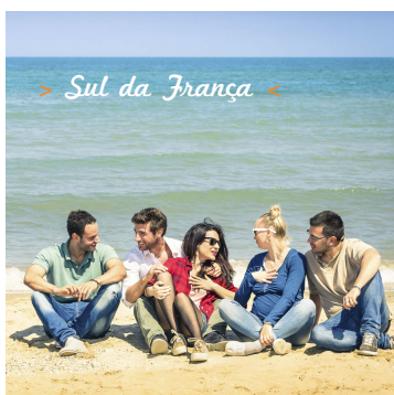
> Sul da França <