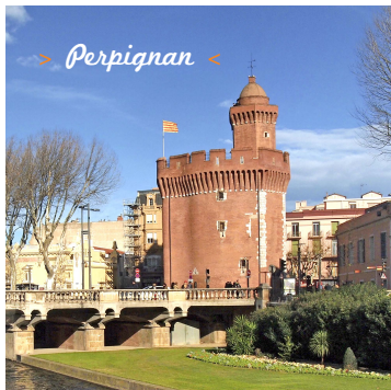
> Perpignan <